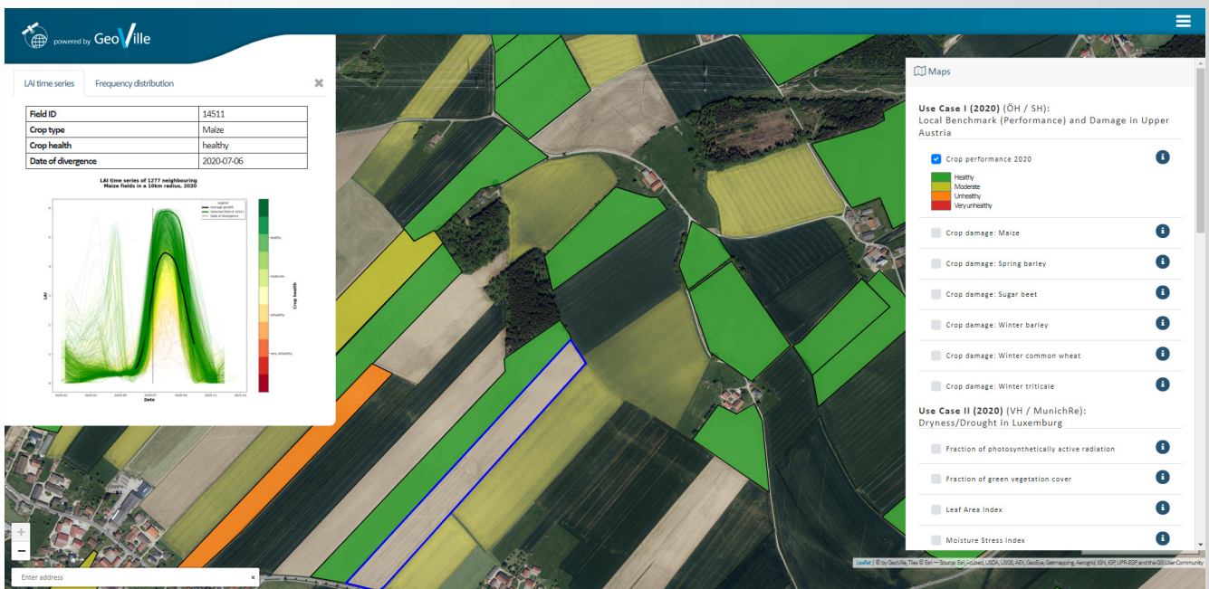
Figure 4: Demonstrator platform developed during the ESA EO Best Practice for Agrolinsurance project.

Another instance of future EO application is considered for merging the traditional indemnity insurance products with innovative index solu-