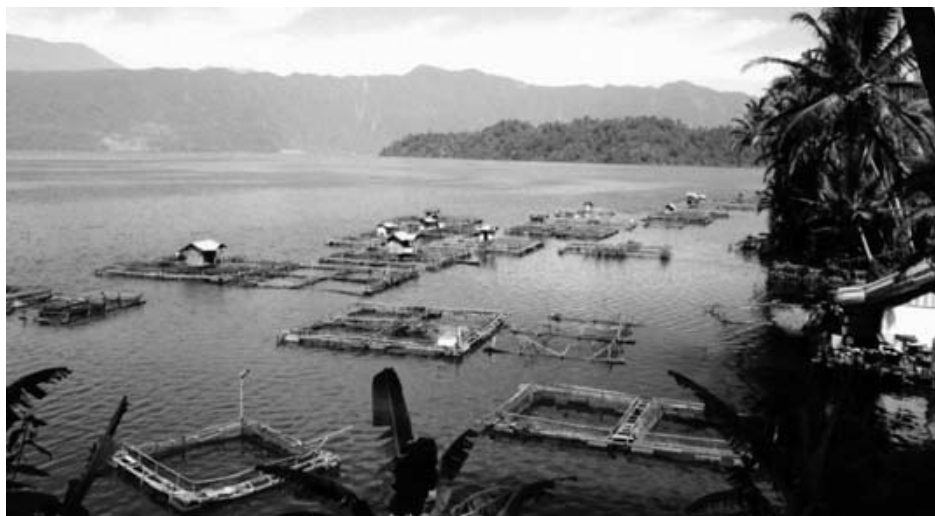
Lake Manajau, West Sumatra, Indonesia